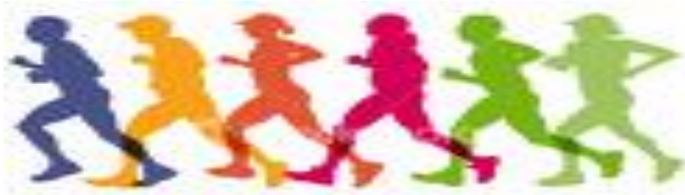
Blue Yellow Orange Red Green Light Green